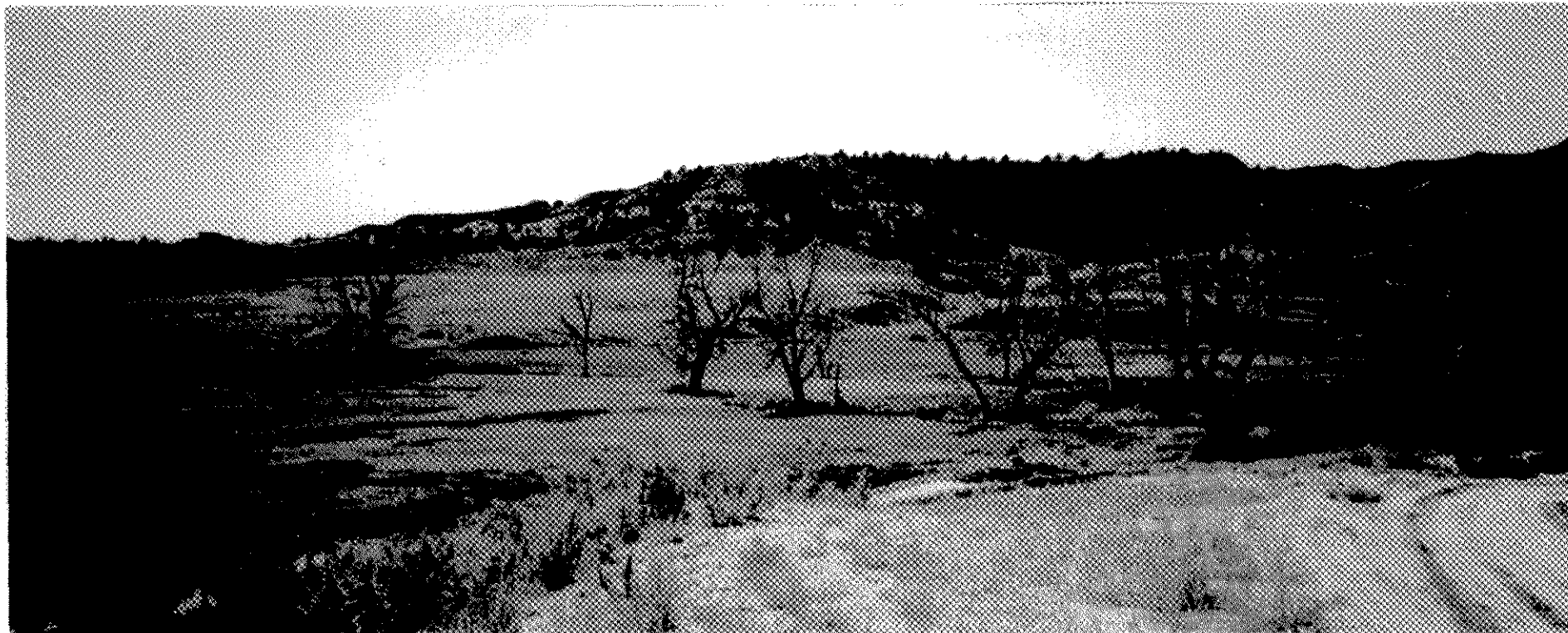
EXHIBIT 2-A - Cottonwood trees killed by winter flooding of CBM water caused by ice jams

Spotted Horse Creek Campbell County, Wyoming August 2001