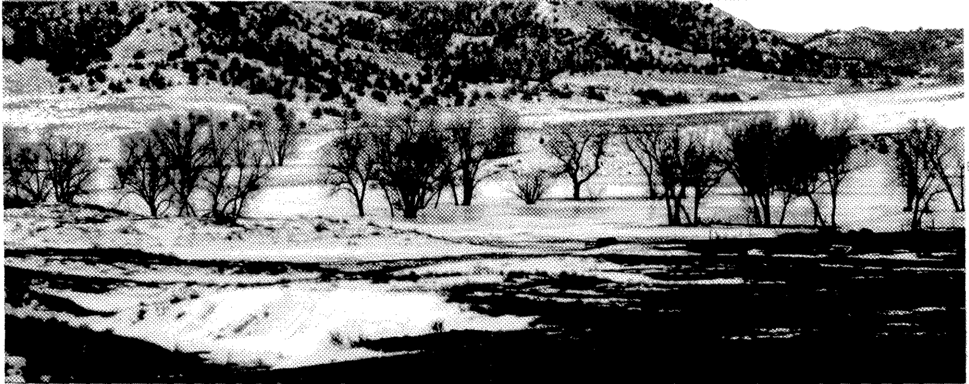
EXHIBIT 1-B - Winter flooding of CBM water caused by ice jams

Spotted Horse Creek Campbell County, Wyoming January 25, 2001