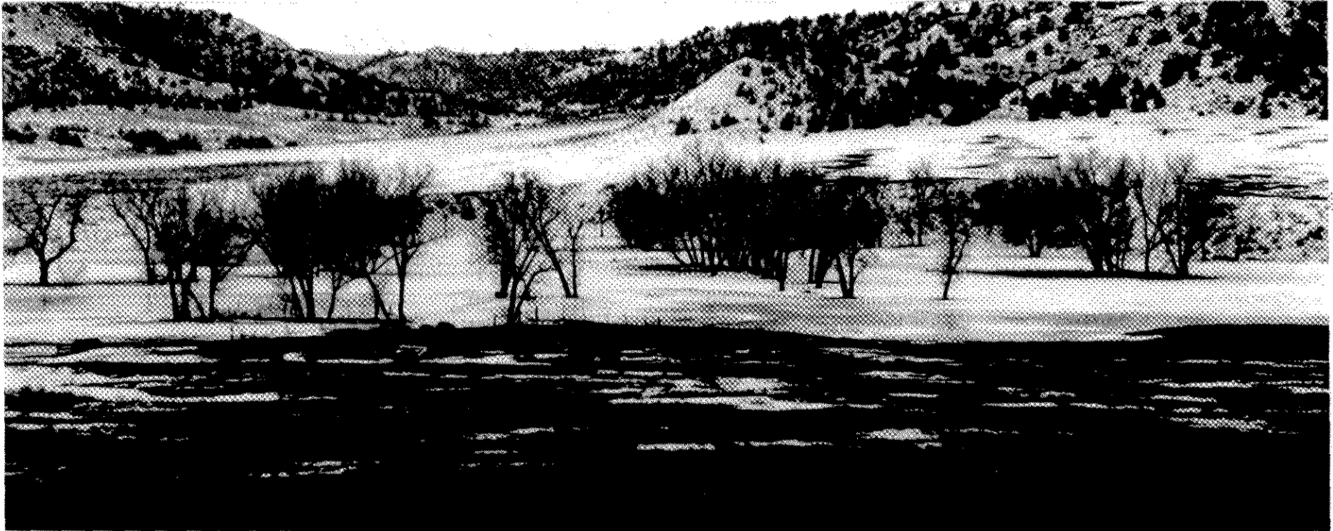
EXHIBIT 1-A - Winter flooding of CBM water caused by ice jams

Spotted Horse Creek Campbell County, Wyoming January 25, 2001