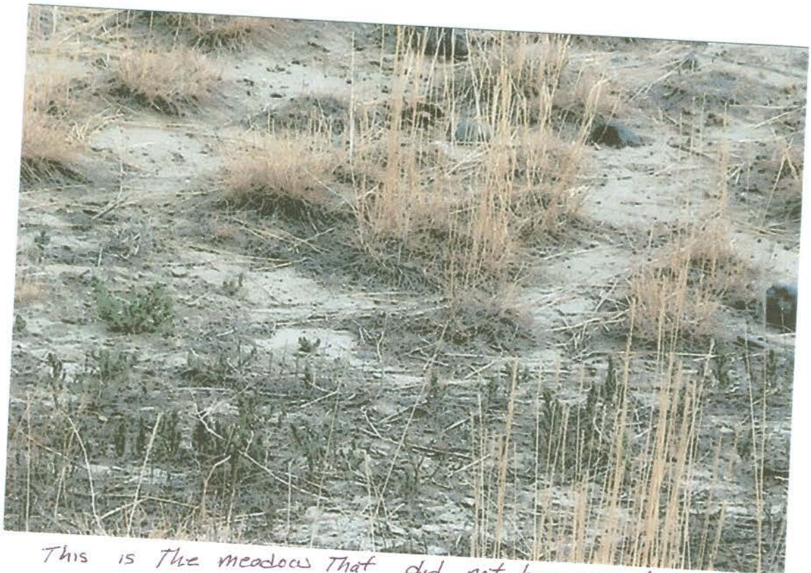
This is the meadow that did not have irrigation water