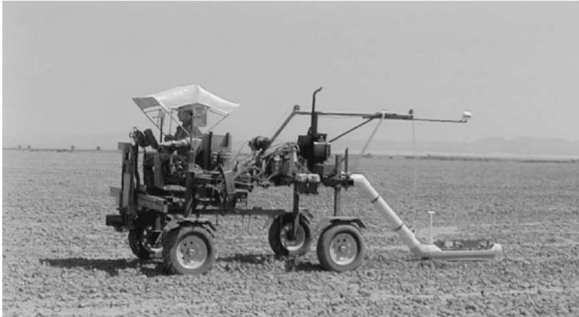
Figure 3. Mobile dual-dipole electromagnetic induction equipment for the continuous measurement of apparent soil electrical conductivity (Corwin and Lesch, 2003).

package, ESAP-95, to select optimal sites for calibration of the relationship between the apparent soil electrical conductivity measured with EMI and the EC of the soil water at different depths measured in the laboratory (Lesch et al., 2000). The soil samples can be easily taken with a soil coring device in the back of a 1-ton pickup with a 2-inch diameter device that can go down 4 to 6 feet or deeper if soil conditions permit. The theoretical background of ESAP-95 is presented by Lesch and his colleagues (Lesch et al., 1995a; Lesch et al., 1995b). Several applications of this software have been reported in the scientific literature (Amezketta, 2007; Amezketta and Lersundi, 2008; Corwin and Lesch, 2003; Corwin et al., 2006) as well as by consulting companies 7 .