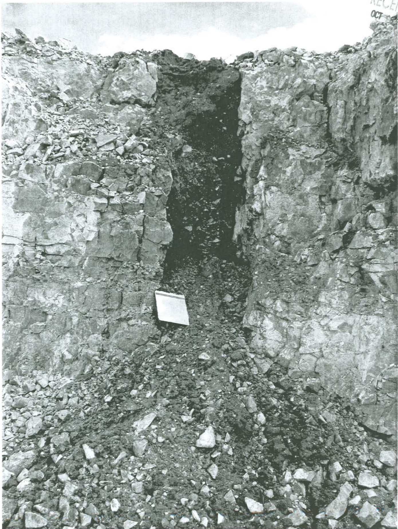
Figure 1. Sand filled fracture exposed at the present surface and now in the wall of Etchepare 7A east of Area "C".