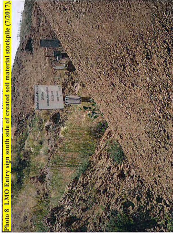
Photo 8 LMO Entry sign south side of created soil material stockpile (7/2017).