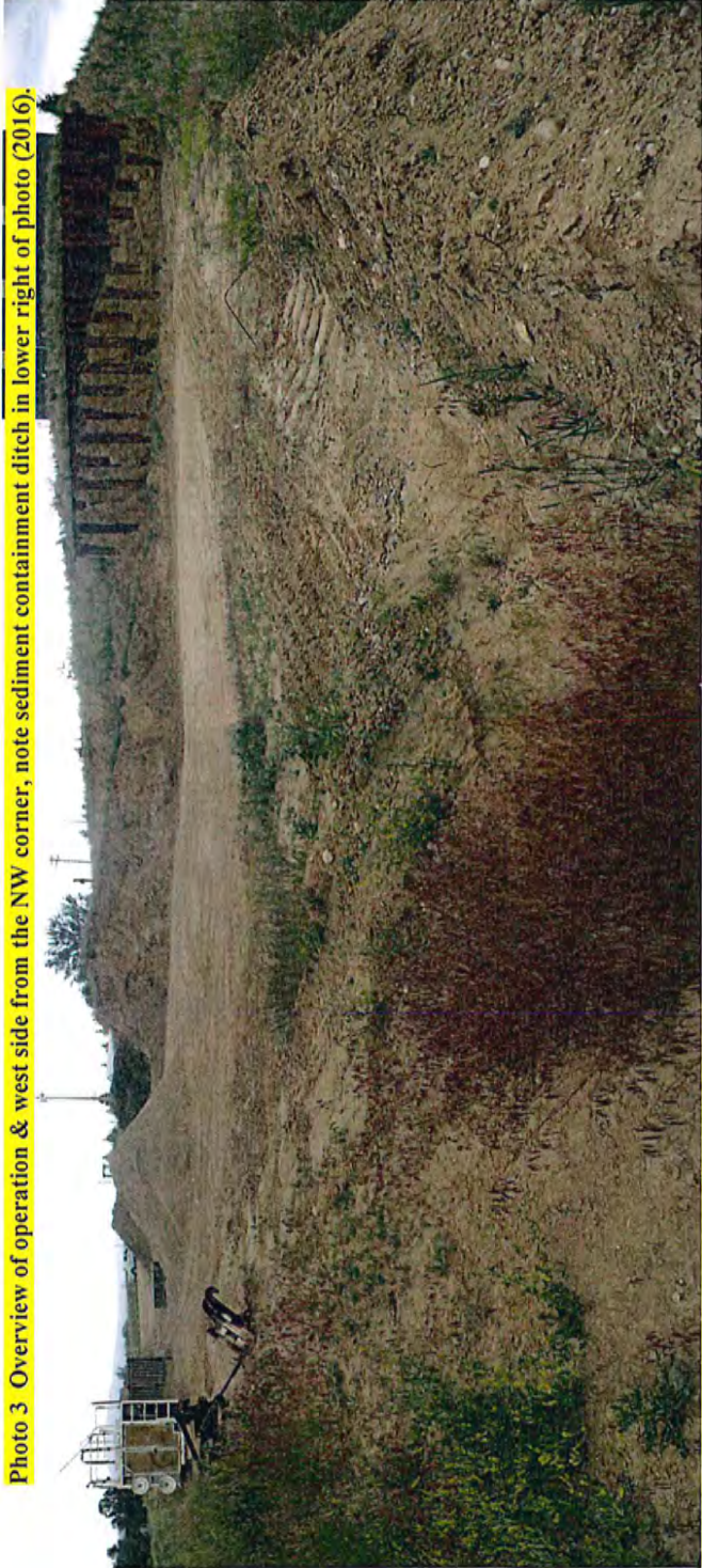
Photo 3 Overview of operation & west side from the NW corner, note sediment containment ditch in lower right of photo (2016).