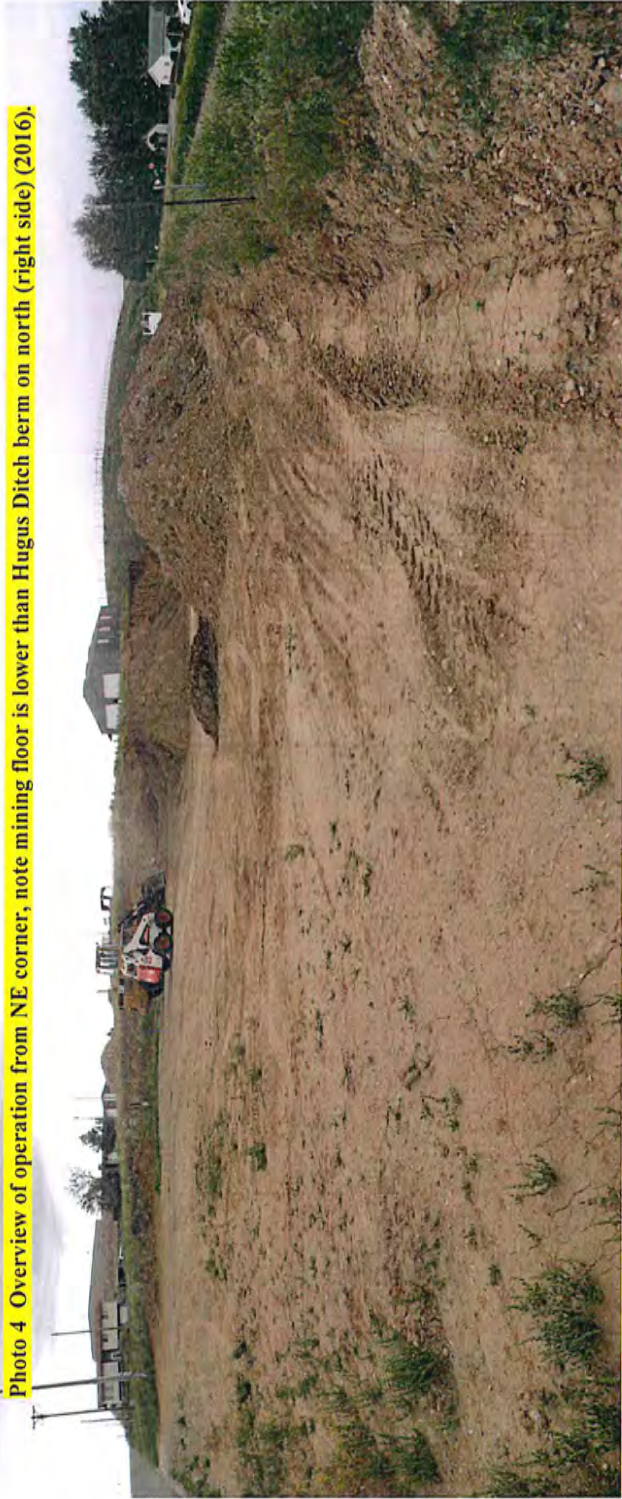
Photo 4 Overview of operation from NE corner, note mining floor is lower than Hugus Ditch berm on north (right side) (2016).