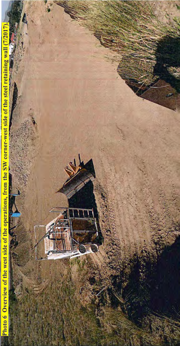
Photo 6 Overview of the west side of the operations, from the SW corner-west side of the steel retaining wall (7/2017).