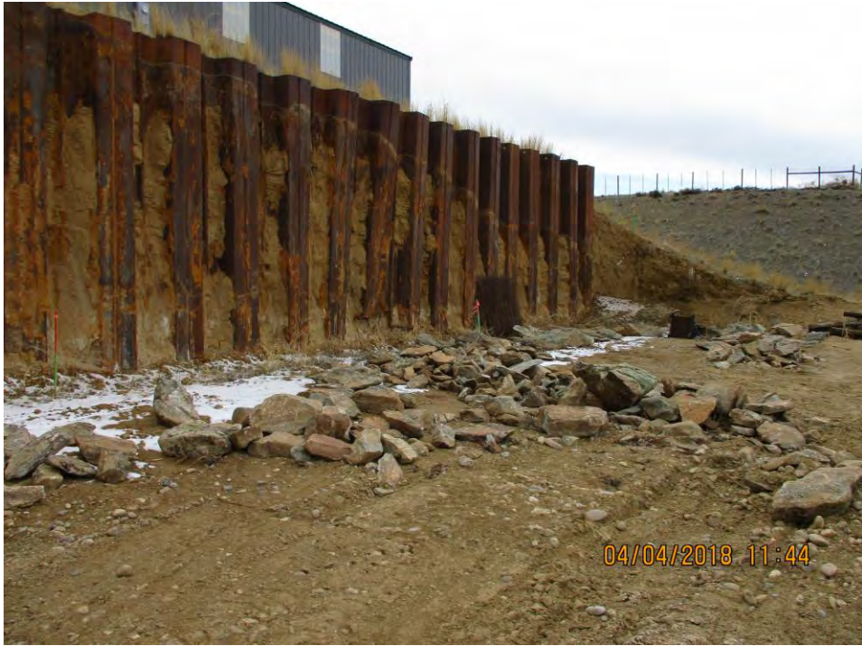
Picture taken by State Mine Inspector 4/4/2018