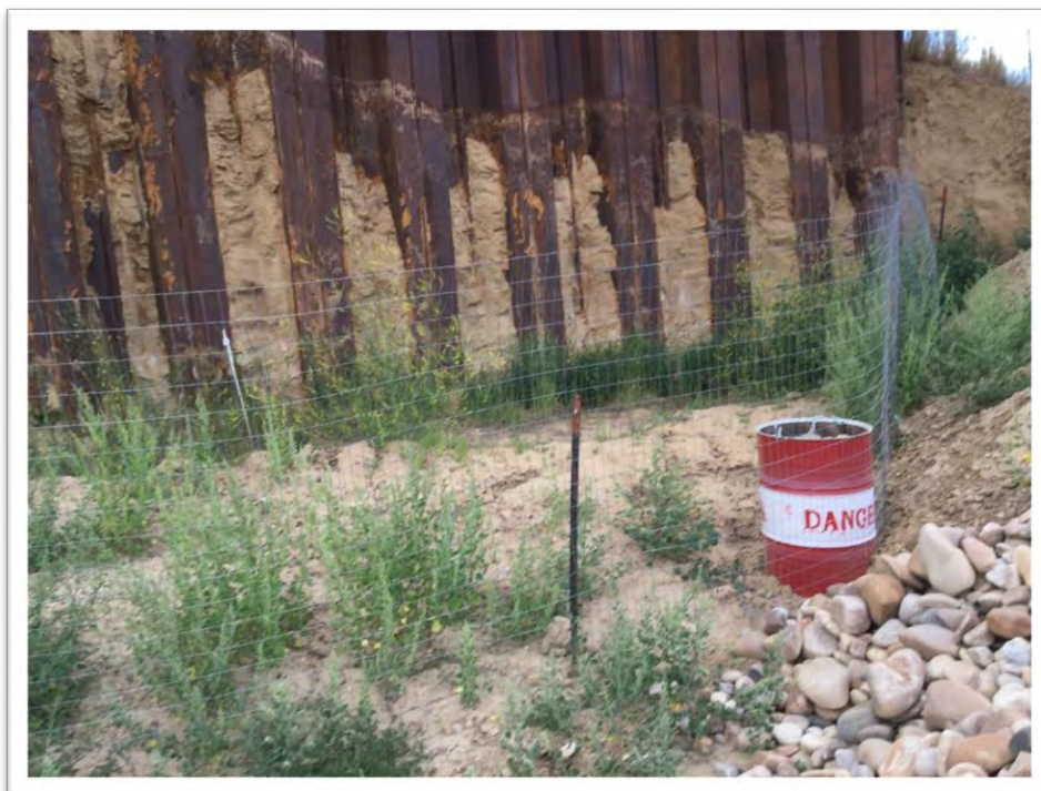
Photo #10: QLN installed and maintains a fence around the perimeter of the steel retaining wall. Photo taken on July 14, 2020.