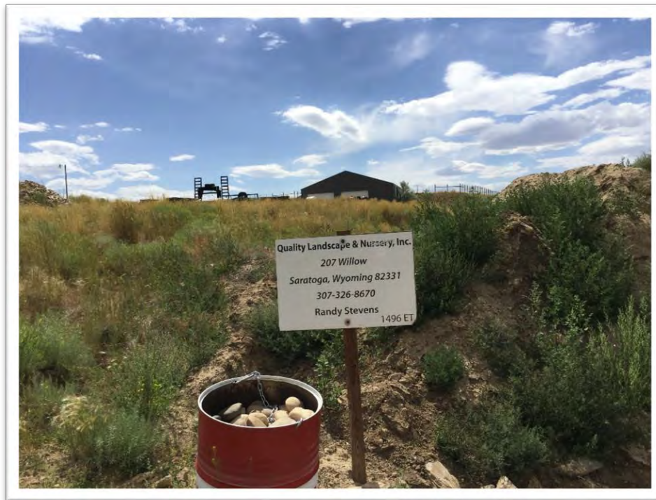
Photo #5: Permit identification sign posted at entrance of the LMO. Photo taken on July 14, 2020.