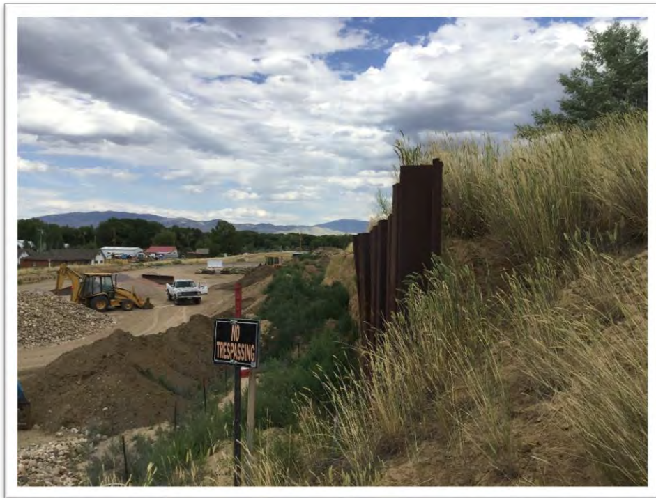
Photo #8: Mining has occurred outside the legal description and has resulted in material damage to steel retaining wall and adjacent property. Photo taken on July 14, 2020.