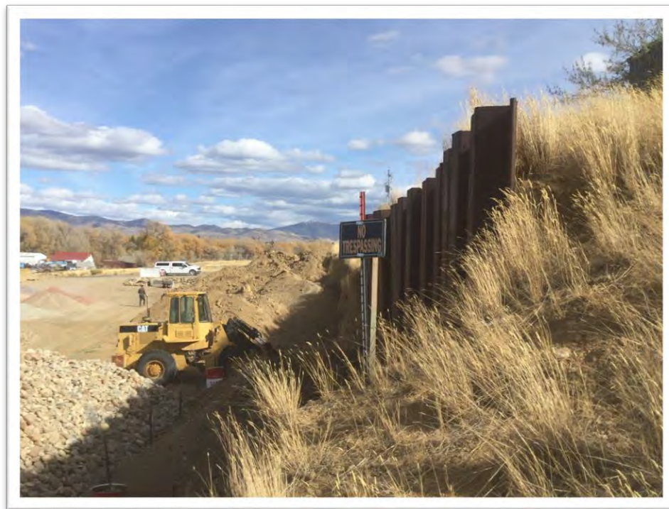
Photo #4: New material stockpiles located on the LMO. Photo taken on October 15, 2020.