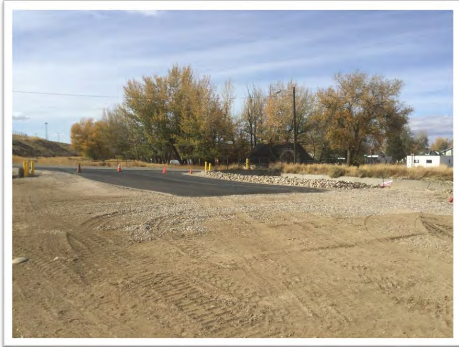
Photo #7: QLN constructed commercial access to the LMO. Photo taken on October 15, 2020.