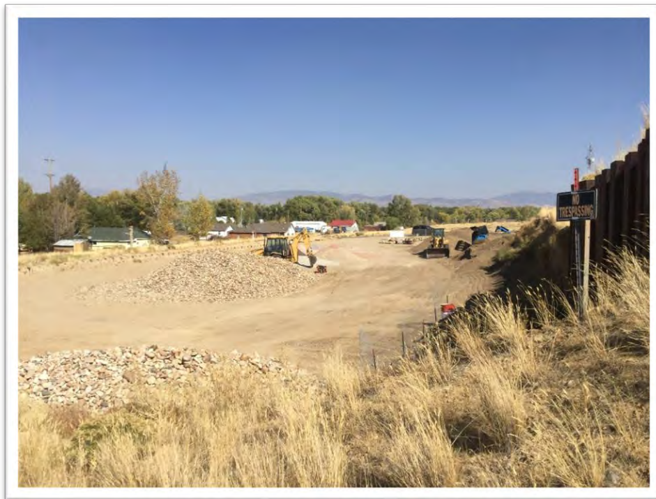
Photo #3: The material stockpiles have been removed from the LMO. Photo taken on September 24, 2020.