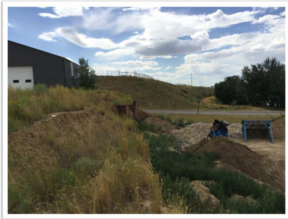
Photo #9: Mining has occurred outside the legal description and has resulted in material damage to steel retaining wall and adjacent property. Photo taken on July 14, 2020.