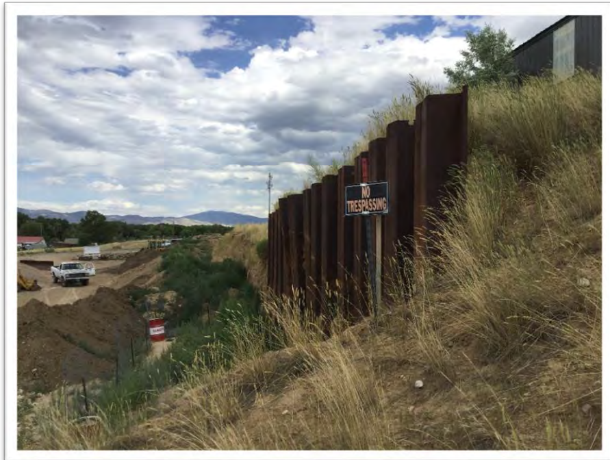
Photo #2: Materials stockpiled against the highwall on the south side of the permit boundary. Photo taken on July 14, 2020.