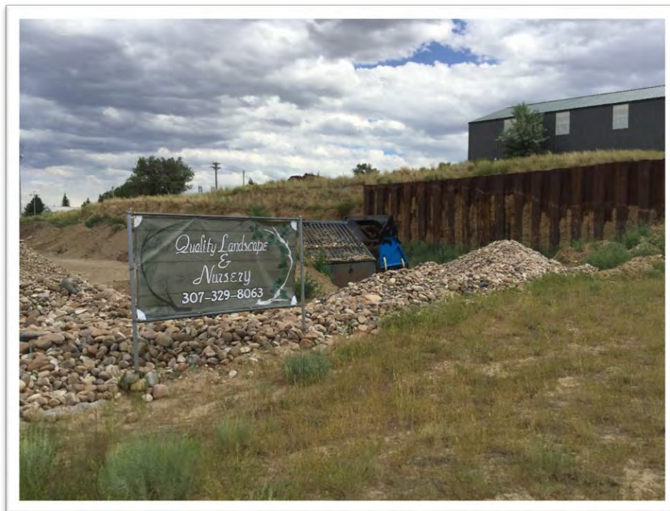
Photo #6: Commercial sign posted on the LMO. Photo taken on July 14, 2020.