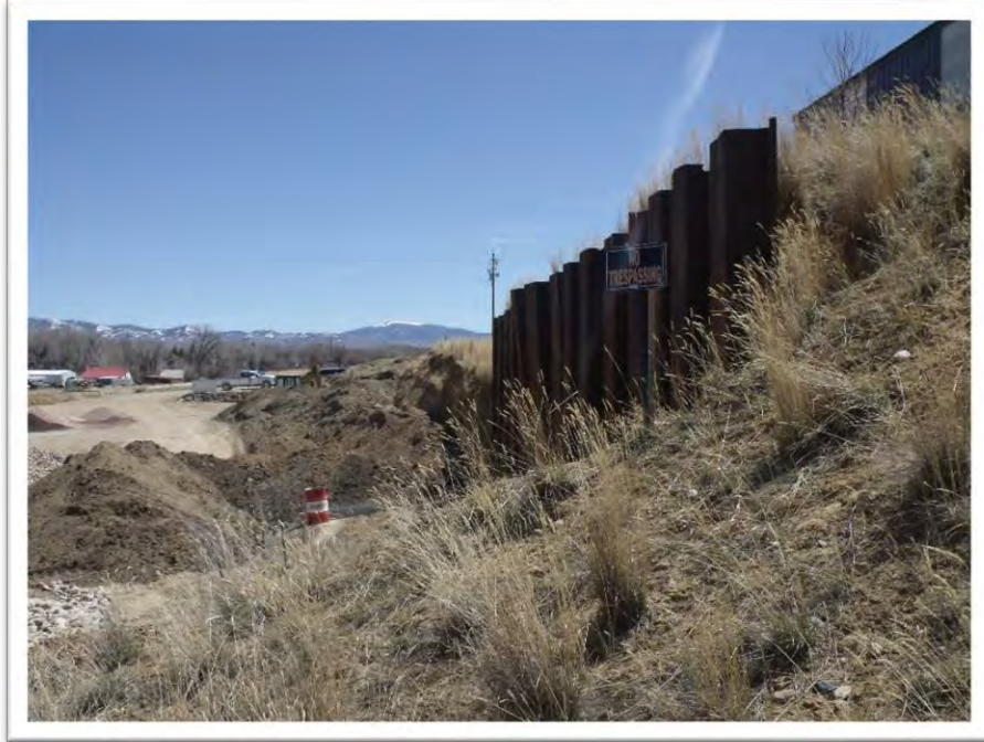
Photo #1: Materials stockpiled against the highwall on the south side of the permit boundary. Photo taken on April 29, 2020.