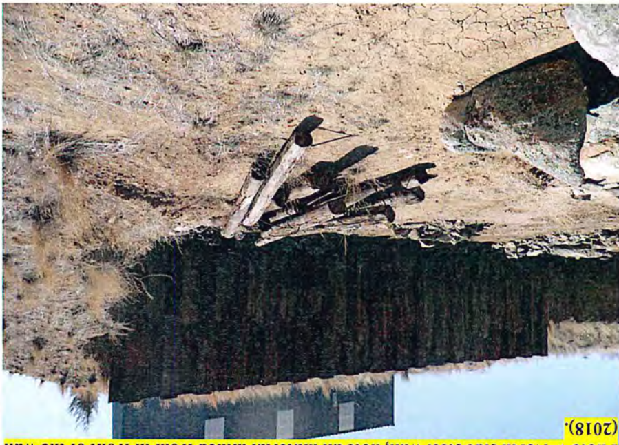
Photo 7 North side steel wall, note all material mined from in front of the wall (2018).