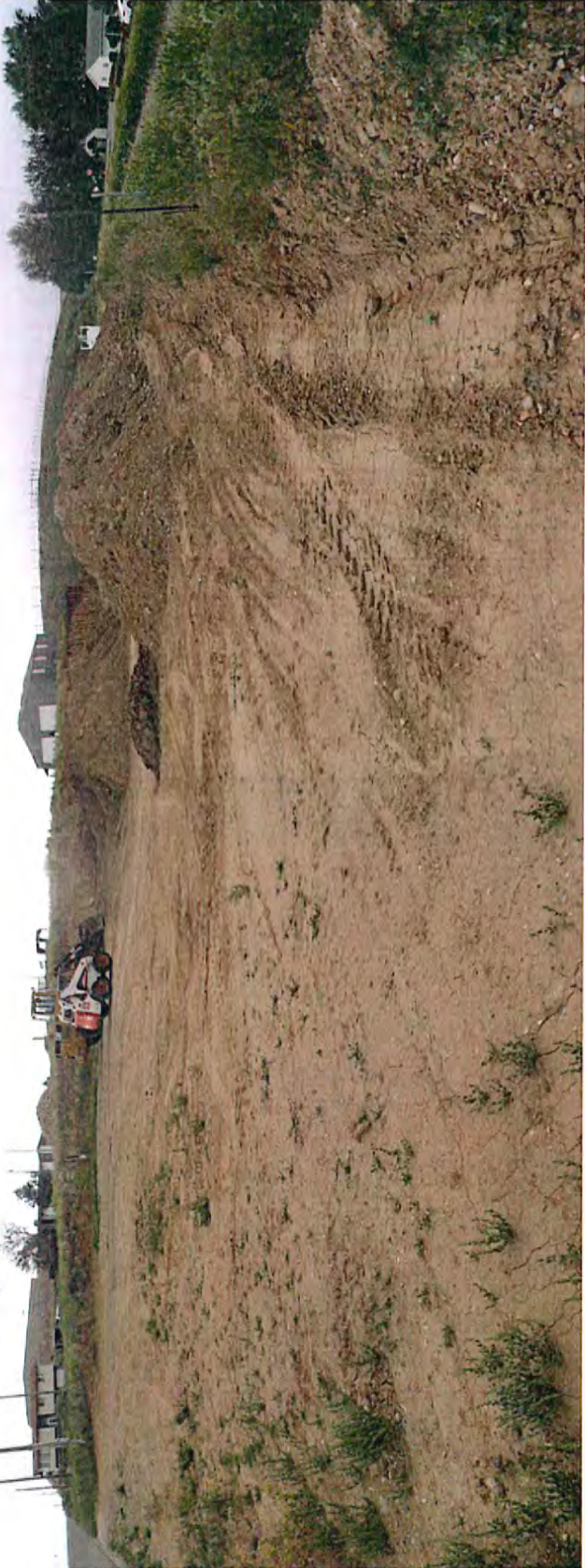
Photo 5 Overview of operation & west side from the NW corner, note sediment containment & operation delineation needed on west side (2018).