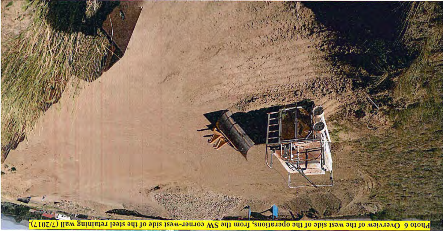
Photo 6 Overview of the west side of the operations, from the SW corner-west side of the steel retaining wall (7/2017).