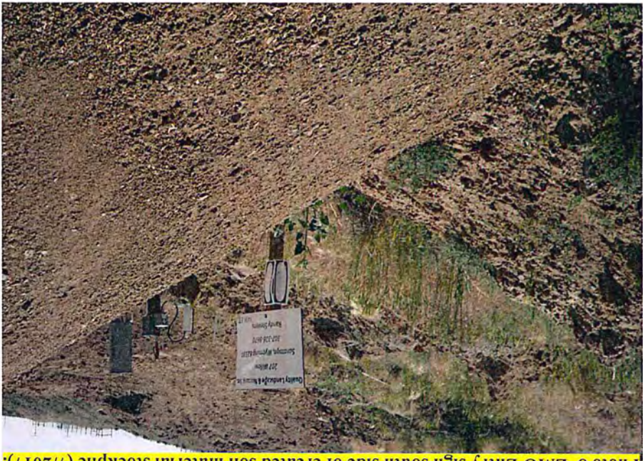
Photo 8 LMO Entry sign south side of created soil material stockpile (7/2017).