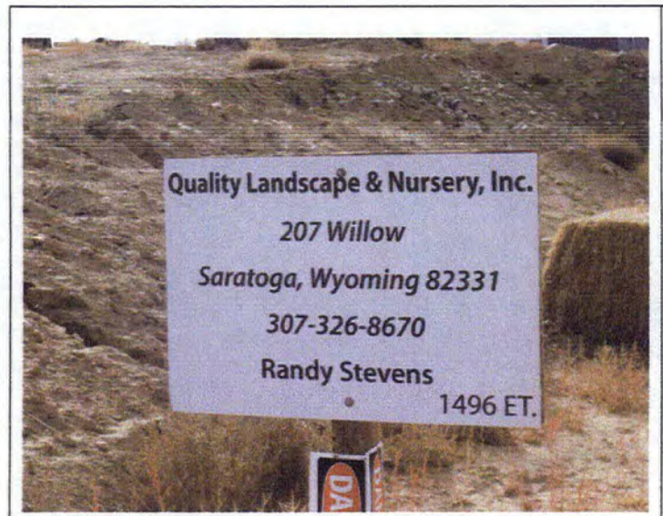
Photo #1: Permit identification sign in place at the entrance of mine.