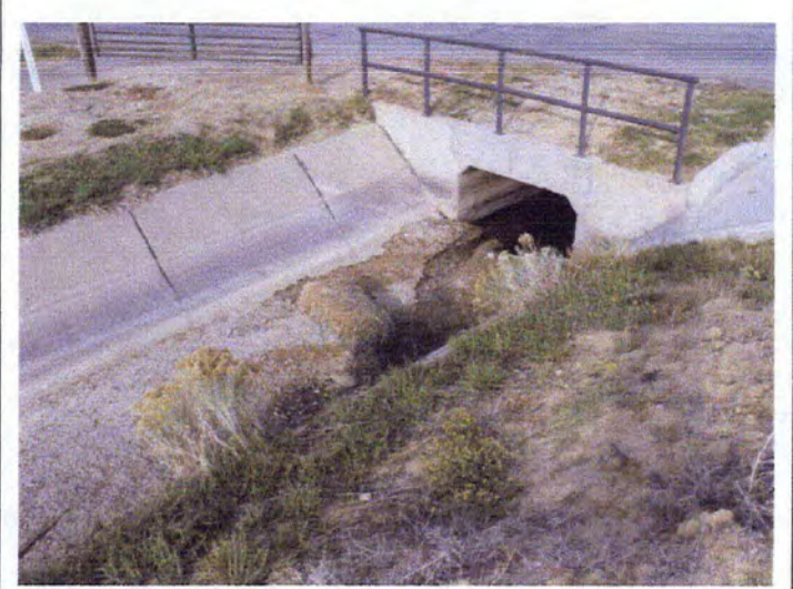
Photo #3: General overview of canal looking northeast direction. Sediment control measures (hay bale) located in the canal.