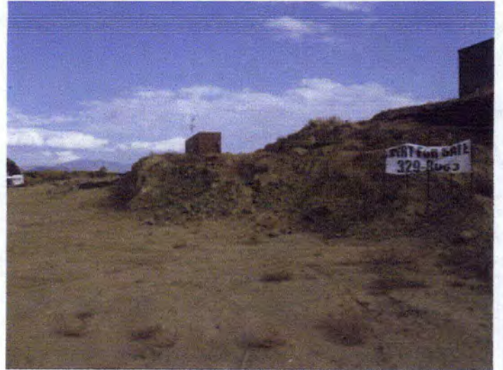
Photo #4: General overview of highwall looking east direction. Steel wall installed to stabilize the slope.