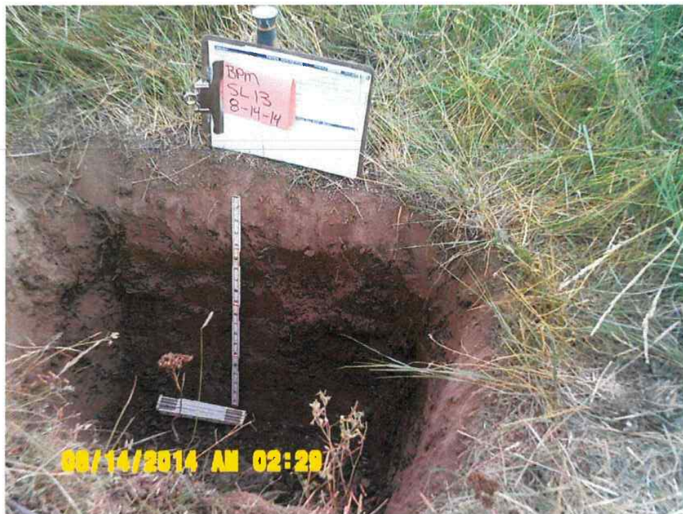
Figure 2.7.3.C11. Map Unit 6/Recluse, Profile SL-13.