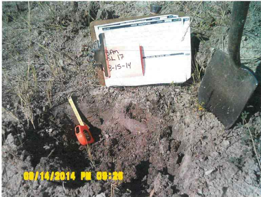
Figure 2.7.3.C20. RL Map unit/Reclaimed Land, Profile SL-17.