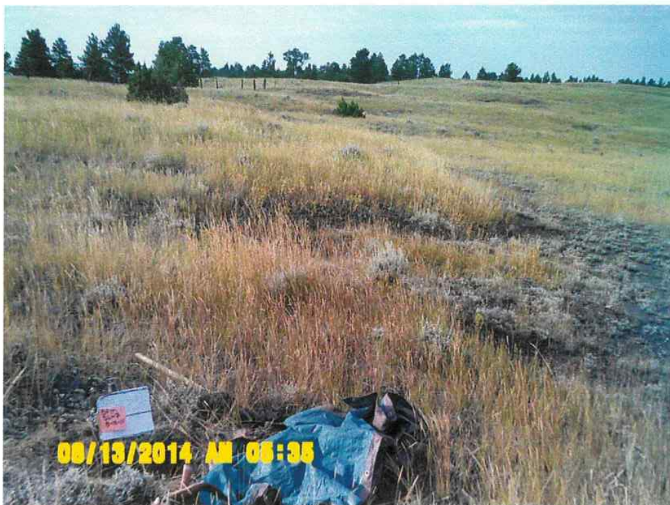
Figure 2.7.3.C8. Map Unit 3/Louviers, Profile SL-7. General Aspect