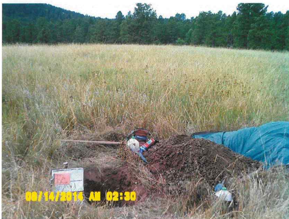
Figure 2.7.3.C12. Map Unit 6/Recluse. Profile SL-3. General Aspect.