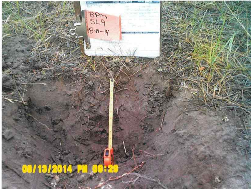
Figure 2.7.3.C13. Map Unit 7/Spangler taxadjunct, Profile SL-9.