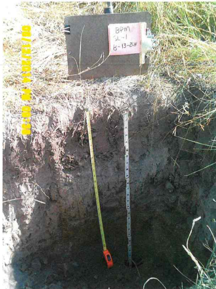
Figure 2.7.3.C15. Map unit 8/Broadhurst, Profile SL-1.