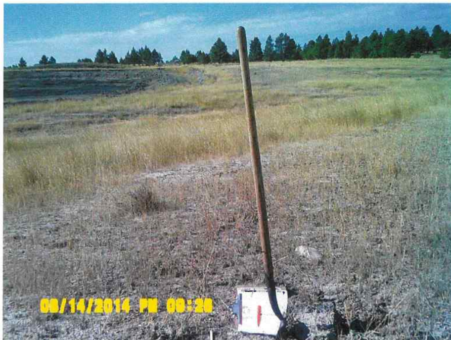
Figure 2.7.3.C21. RL Map unit/Reclaimed Land, Profile SL-17. General Aspect.