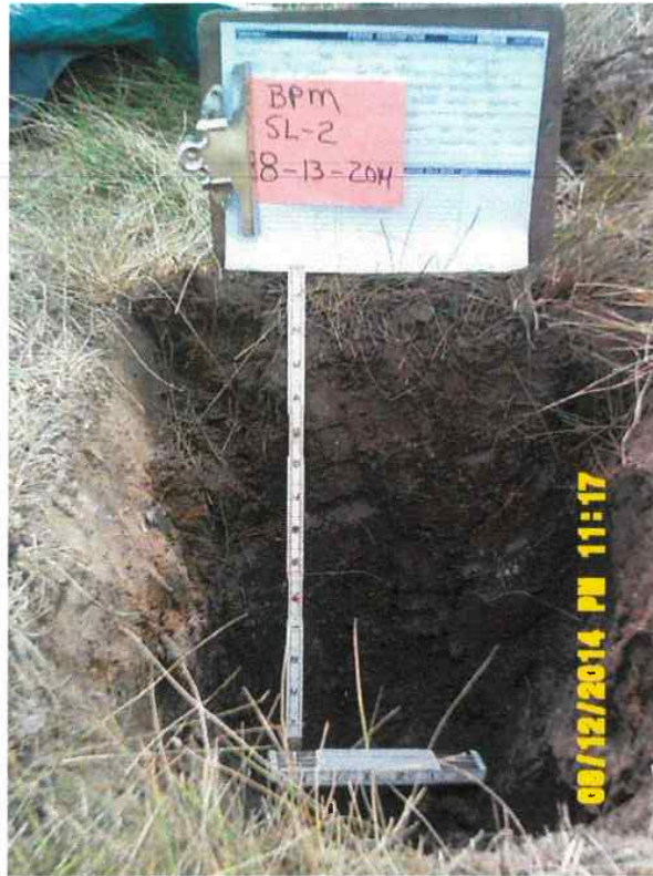
Figure 2.7.3.C16. Map Unit 8a/Wetland Soils, Profile SL-2.