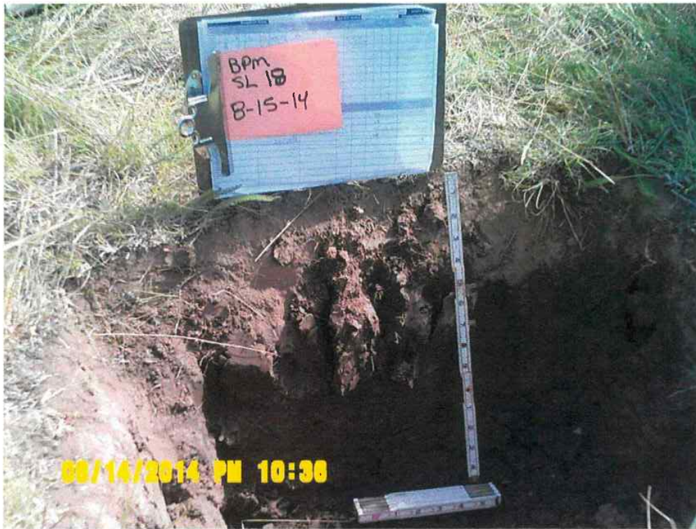
Figure 2.7.3.C18. Map Unit 9/Unnamed Argiustol, Profile SL-18.