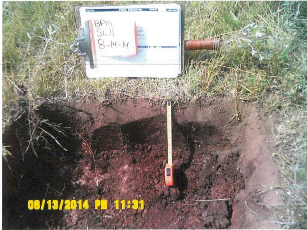
Figure 2.7.3.C1. Map Unit 1/Butche Series, Profile SL-11.