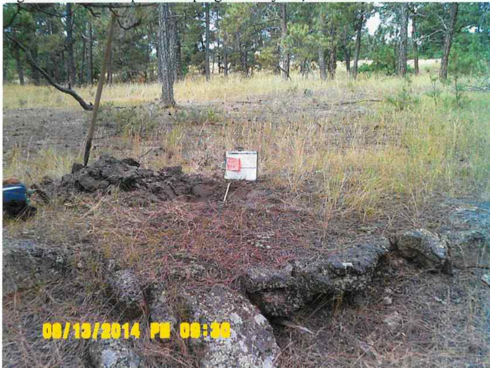
Figure 2.7.3.C14. Map Unit 7/Spangler taxadjunct. Profile SL-9. General Aspect.