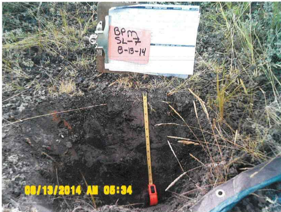
Figure 2.7.3.C7. Map Unit 3/Louviers, Profile SL-7.