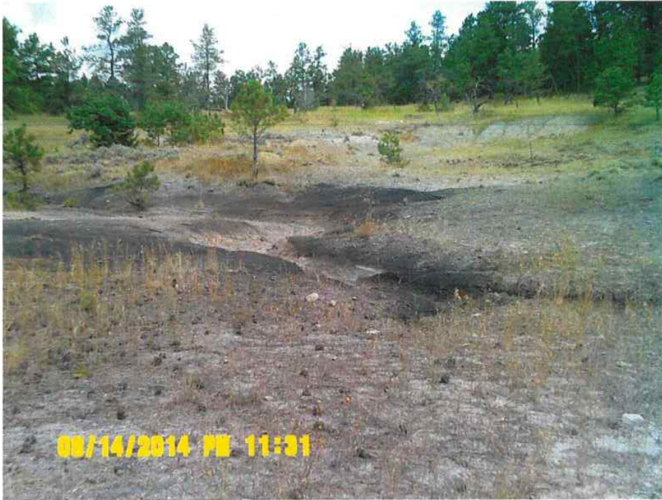
Figure 2.7.3.C24. Louviers/Bare Outcrop Complex; General Aspect.