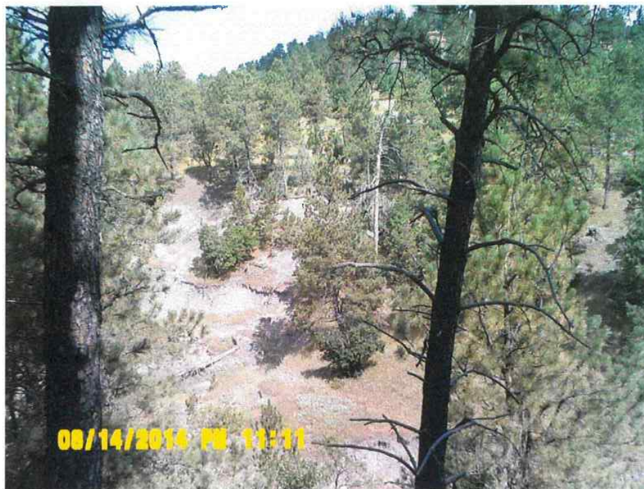
Figure 2.7.3.C23. Map Unit RC2, Ravine Complex 2. General Aspect.