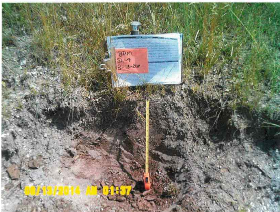
Figure 2.7.3.C4. Map Unit 2/Grummit Series, Profile SL-4.