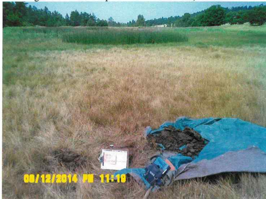
Figure 2.7.3.C17. Map unit 8a/Wetland Soils, Profile SL-2; General Aspect.