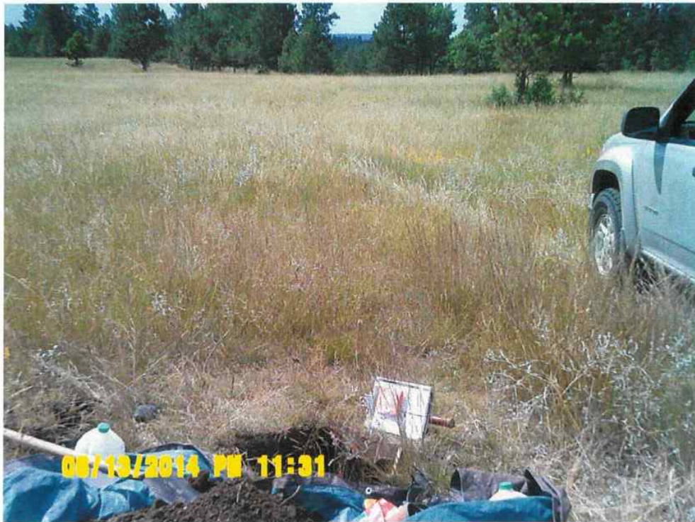
Figure 2.7.3.C2. Map Unit 1/Butche Series, Profile SL-11. General Aspect