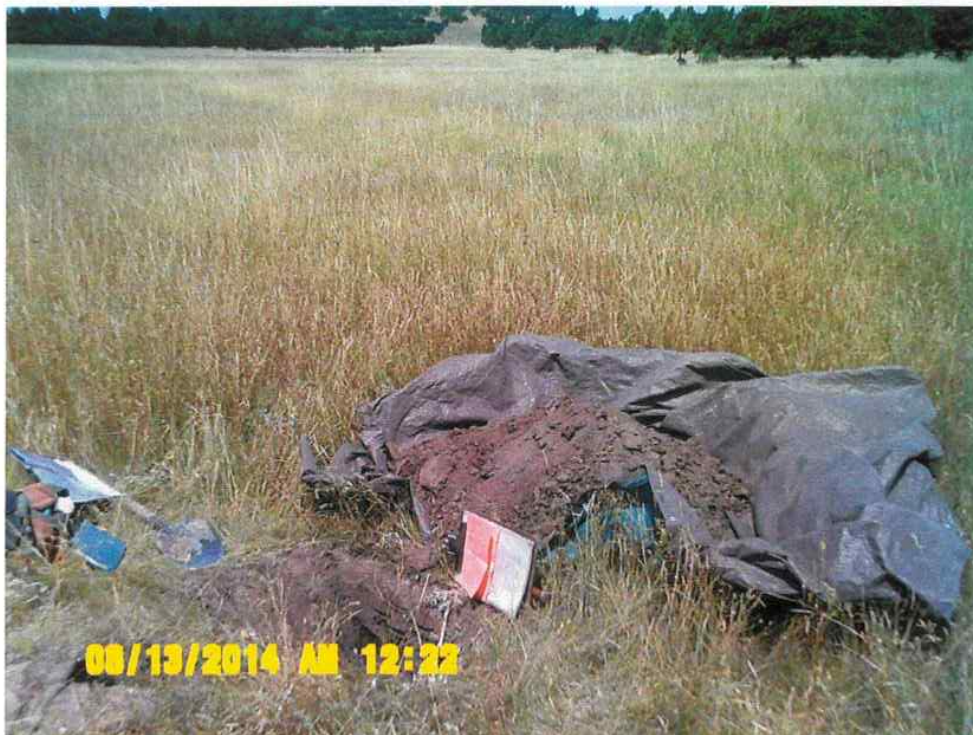
Figure 2.7.3.C10. Map Unit 5/Querc. Profile SL-3. General Aspect.