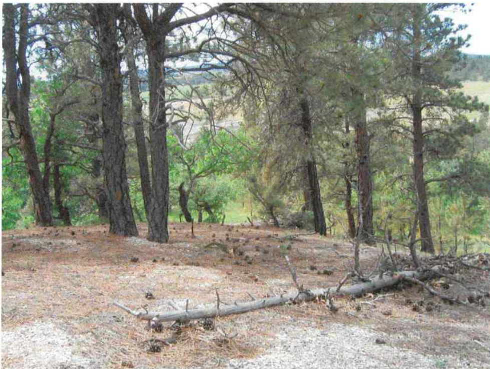
Figure 2.7.3.C6. Map Unit 2a/Steep Grummit Series, General Aspect.