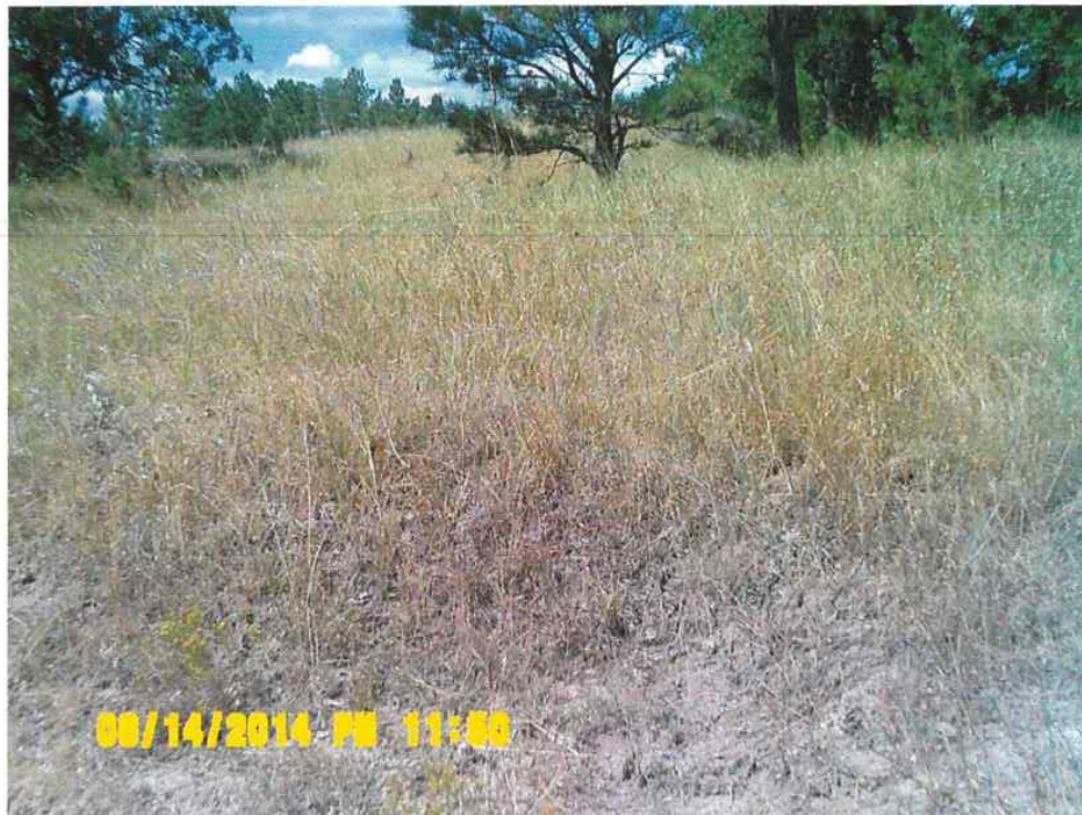
Figure 2.7.3.C3. Map Unit 1a, Butche/Spangler Complex. General Aspect.