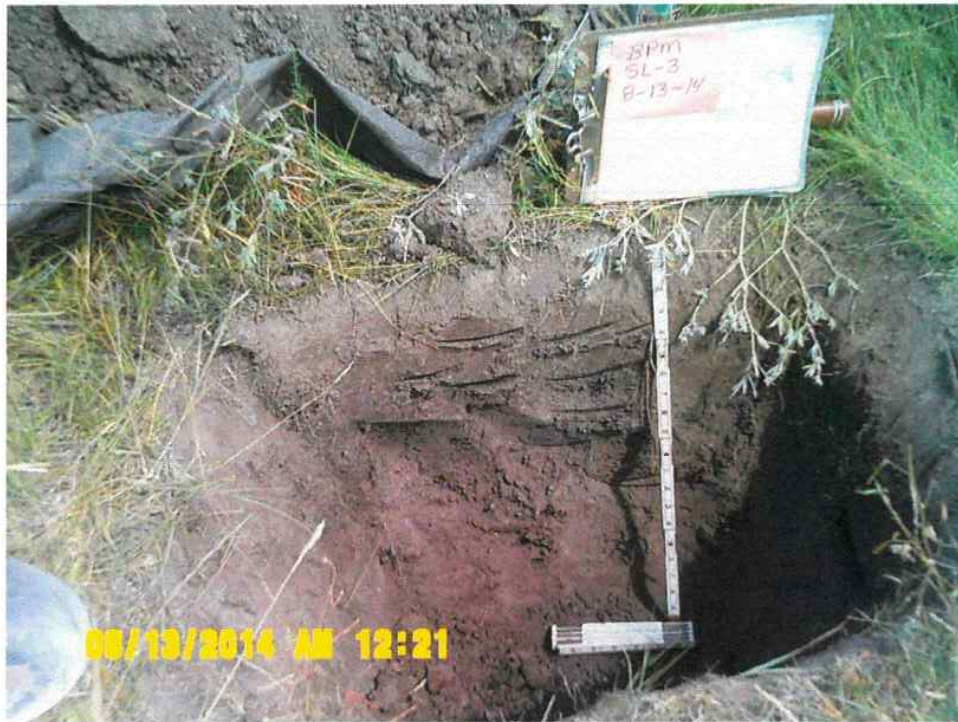
Figure 2.7.3.C9. Map Unit 5/Querc, Profile SL-3.