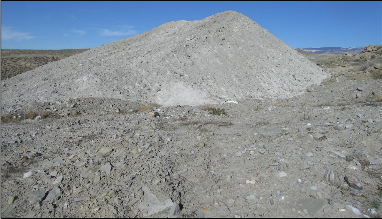
Photo 1 (above) looks generally north and shows the western spoil pile composed primarily of ashy overburden. Photo 2 (below) looks generally southwest and shows the 2011 pit area. Any runoff appears to have been contained within the pit, however periodic inspections should be conducted to ensure the integrity of the berm is maintained.