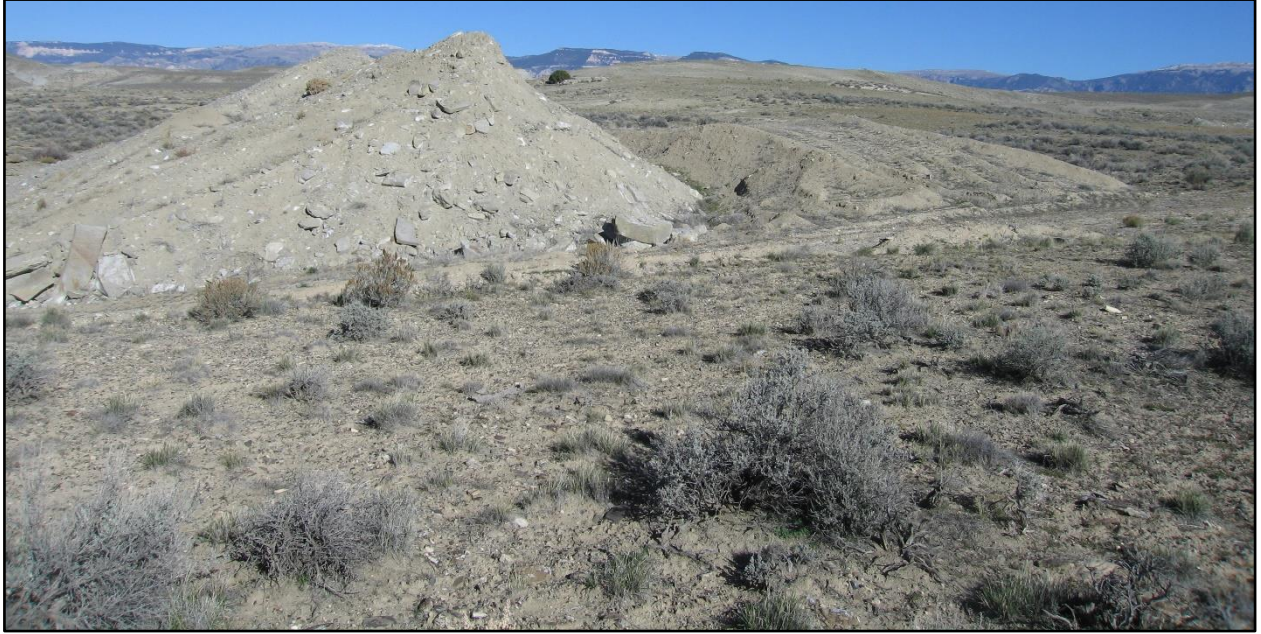
Photo 3 (above) looks generally north and shows the eastern spoil (overburden) pile and the adjacent topsoil pile. Photo 4 (below) looks generally southwest and shows a portion of the area adjacent to Bear Creek reclaimed by GBC encompassing approximately 2.2 acres. The grass cover appeared to be fairly dense, however, it was difficult to tell the species and if cheatgrass was a significant component. Some shrubs were noted along fringe of the reclaimed area.