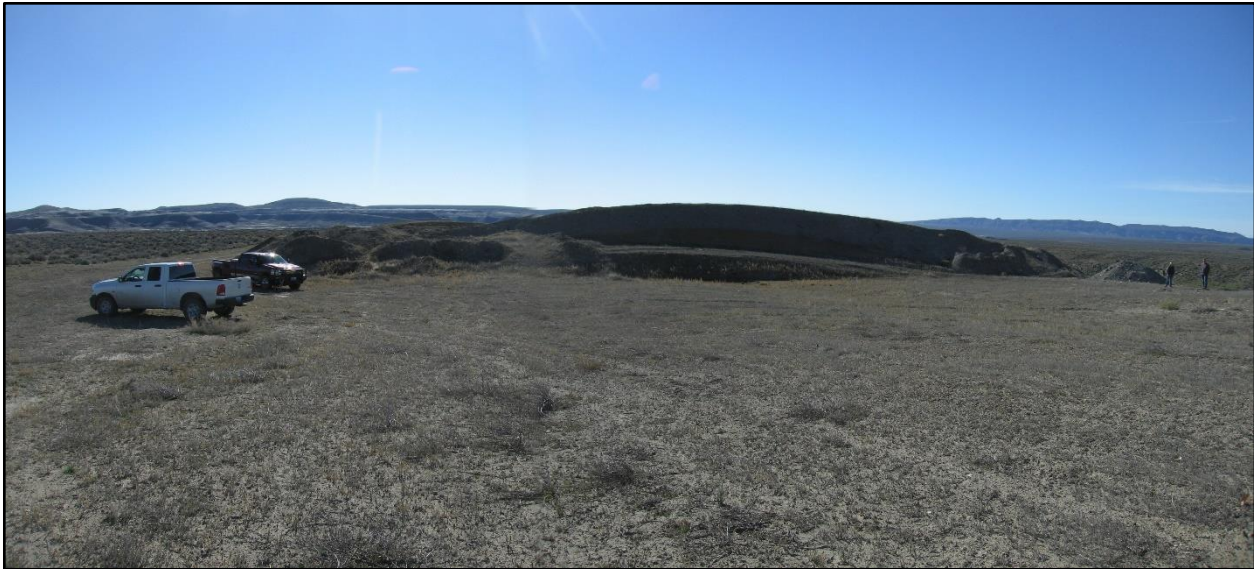
Photo 5 (above) looks south and the large topsoil stockpile located at the southern end of the stripped area.