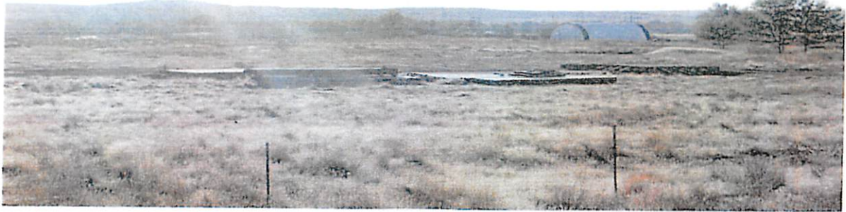
Hopper Disposal Transfer Station location 9/28/2017 starting construction of scales without a permit.