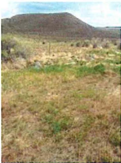
#2 CA.jpg 1327K