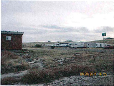
Crossed Arrows Subdivsion (2).JPG 1977K