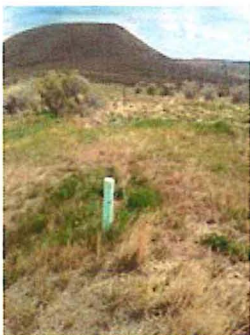
Crosssed Arrows Park.jpg 1327K