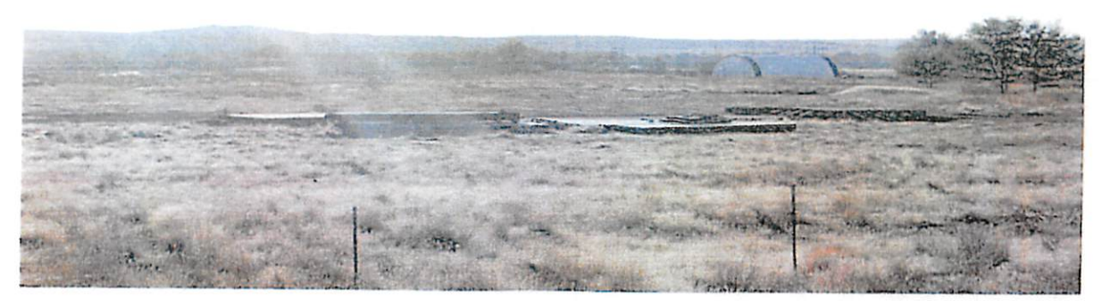
Hopper Disposal Transfer Station location 9/28/2017 starting construction of scales without a permit.